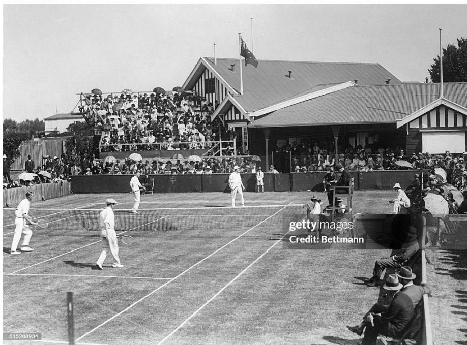
AO Doubles Elimination Match 1922